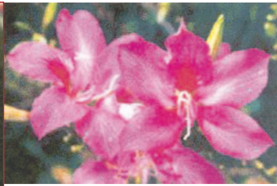
Left: 'Cool, calm' Orchid formula helps if you are feeling hot and bothered. Centre: Lotus formula promotes vitality and enhances the other remedies. Right: Pink flowers promote a sense of spiritual ease.